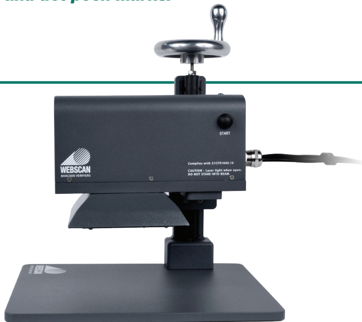
Model Shown: TRUCHECK FLEXHITE DPM

WEBCAN BARCODE VERIFIERS A PART OF COGNEX